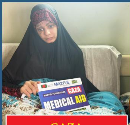
GAZA Medical Aid