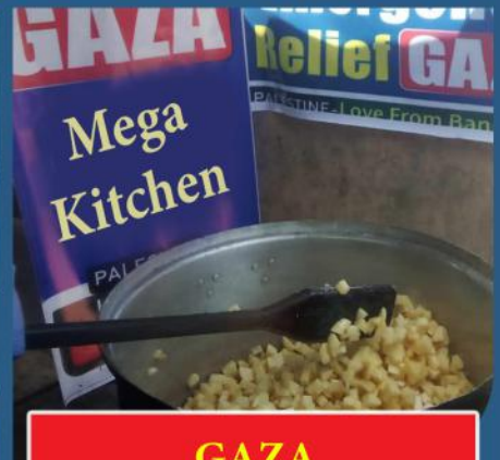
GAZA Mastul Mega Kitchen