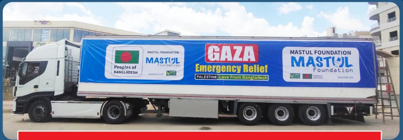
1 full lorry of foodpack in Palestine - GAZA