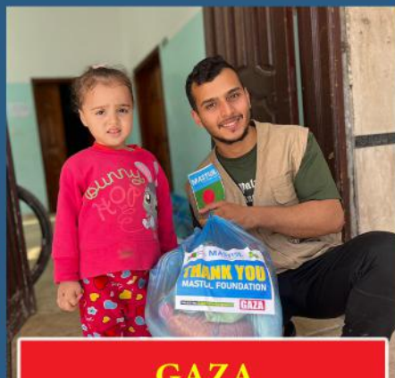
GAZA Foodpack Distribution