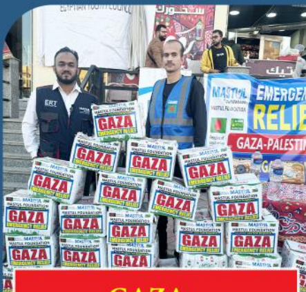
GAZA Emergency Relief