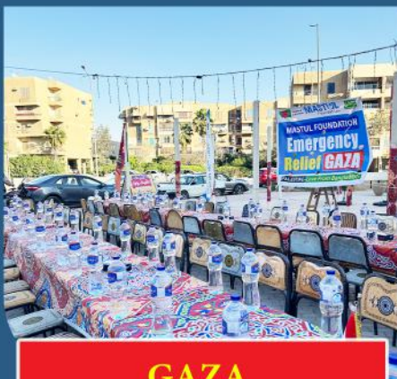
GAZA Iftar Distribution