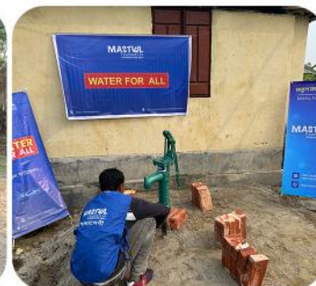
Setting Up A Tubewell