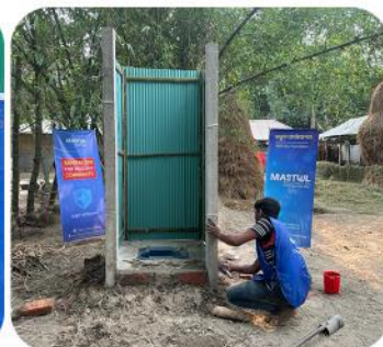
Sanitation And Hygiene